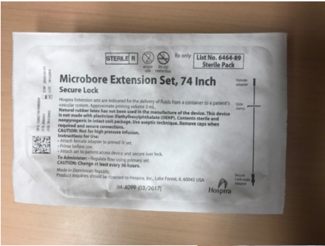
Blood tubing (med rooms)