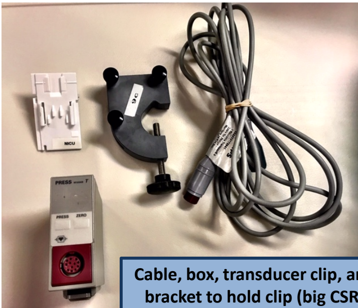
Cable, box, transducer clip, and bracket to hold clip (big CSR)